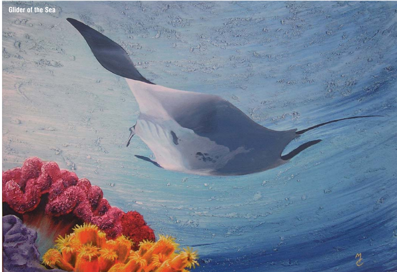
Glider of the Sea