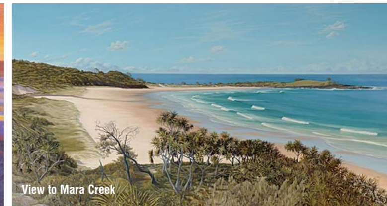
View to Mara Creek

"I looked carefully at the artworks, the techniques, the media, quality and the subject matter ... making sure that the diverse range of work displayed would appeal to all art tastes," she explained.