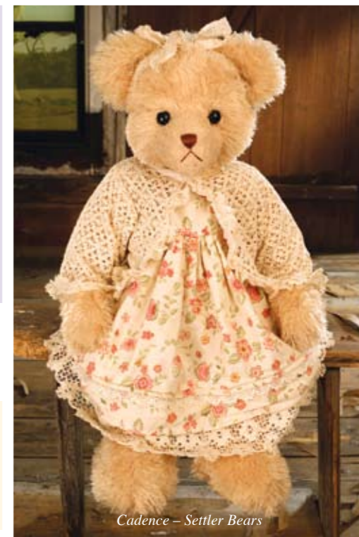
Cadence – Settler Bears

CATEGORY 12 MANUFACTURED LARGE BEAR DRESSED COSTUMED Please copy your selection to entry coupon on page 45 Army Bear – Elka Bears Cadence – Settler Bears