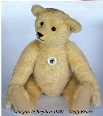
Margarete Replica 1909 – Steiff Bears