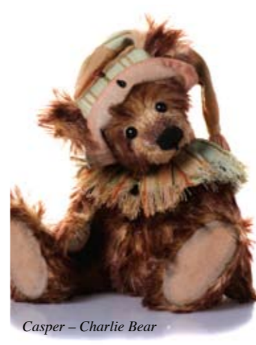
Casper – Charlie Bear

CATEGORY 10 MANUFACTURED SMALL BEAR – DRESSED/COSTUMED Please copy your selection to entry coupon on page 45 Casper – Charlie Bear Charlotte – Settler Bears Constable Curruthers – Elka Bears Joseph – Steiff Bears