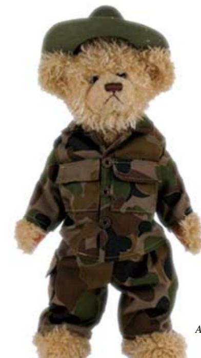
Army Bear – Elka Bears

CATEGORY 12 MANUFACTURED LARGE BEAR DRESSED COSTUMED Please copy your selection to entry coupon on page 45 Army Bear – Elka Bears Cadence – Settler Bears