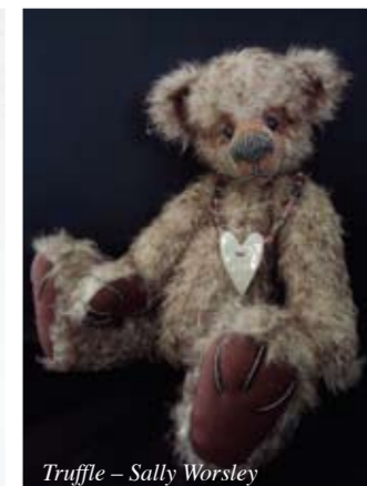
Truffle – Sally Worsley