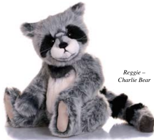
Reggie – Charlie Bear