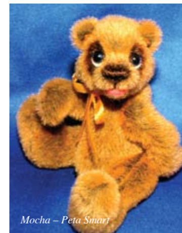
Mocha – Peta Smart