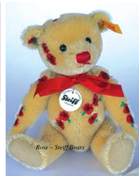
Rose – Steiff Bears

CATEGORY 11 MAUFACTURED SMALL BEAR UNDRESSED Please copy your selection to entry coupon on page 45 Brandwell – Russ Bears Rose – Steiff Bears Alice – Charlie Bears