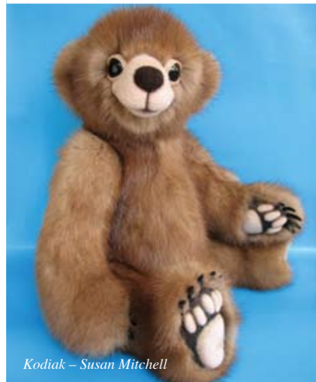
Kodiak