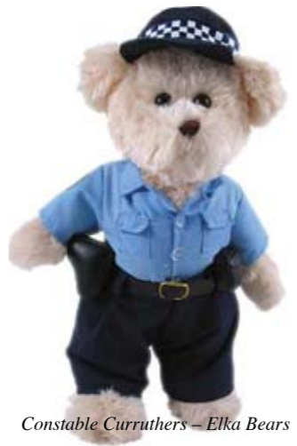
Constable Curruthers – Elka Bears