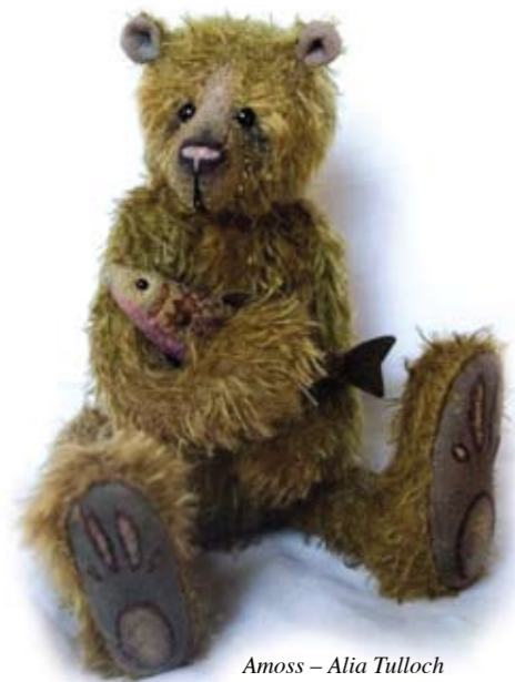
Amoss – Alia Tulloch