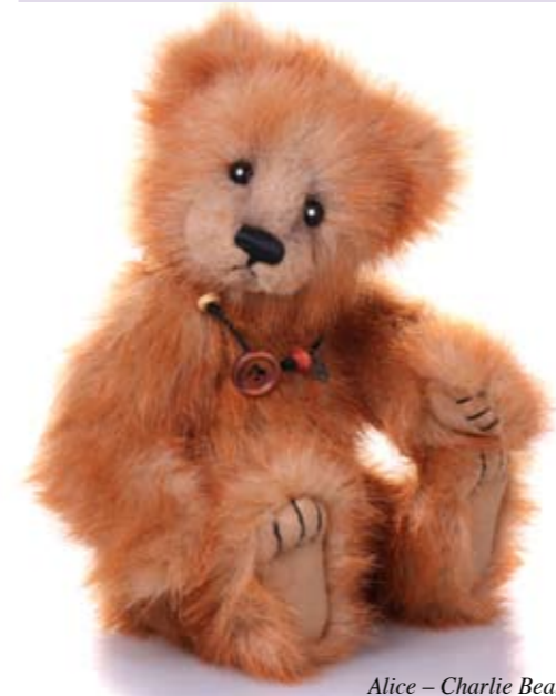
Alice – Charlie Bears