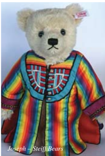
Joseph – Steiff Bears