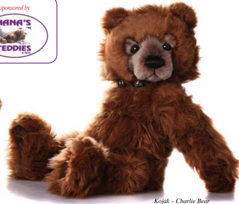
Kojak – Charlie Bear